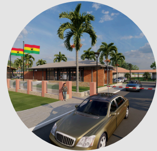
Bright Osie Bediako